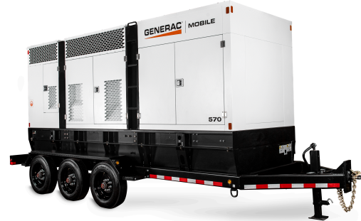
Picture shown may not reflect actual configuration.

*Assembled in the USA using domestic and foreign parts